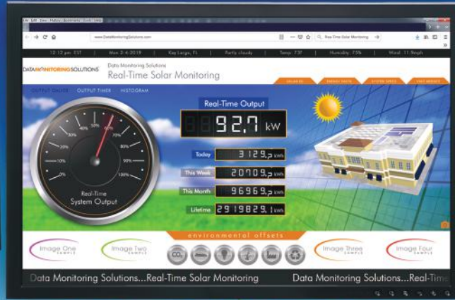
CUSTOMIZED FRONT-END DISPLAY